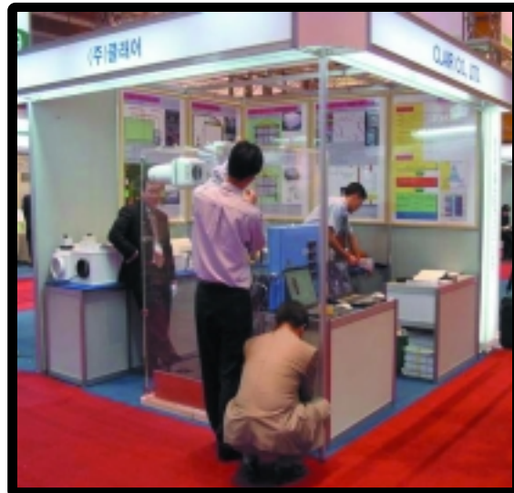
INTERNATIONAL CLEAN AIR EXHIBITION 2002, KOREA

Kilttox can provide a ventilator, system or service to totally eradicate any damp related problem. The one sure way to totally eliminate condensation, mould growth, mildew and indoor air pollution is to provide 'adequate' ventilation, not the conventional extractor fans or passive ventilation recommended under the current Part F guidelines, but ventilation capable of creating the 'whole house' air changes, recommended under the Department of Environment Transport and the Regions definition of 'adequate ventilation'. There are changes on the way that will make it virtually impossible for anyone to ignore heat recovery ventilators: The Department of Health National Air Quality Strategy is to be upgraded to include internal air quality; The Department of Transport, Local Government and the Regions is likely to specify the use of heat recovery ventilators rather than conventional extractor fans in their next revision of the 'Part F' Building Regulation Guidelines. Both of these decisions will impact dramatically on the ventilation industry and will certainly